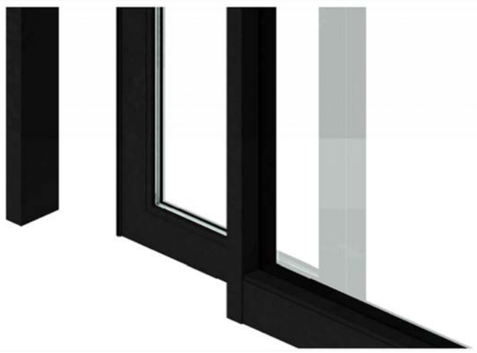
SRT™ BARN 4" ELITE CURB BASE

HEAD OFFICE 130 Nolan Court Markham, ONL3R 2V7 Canada www.pc350.com | info@pc350.com