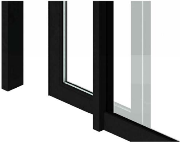
SRT™ BARN 4" NARROW BASE