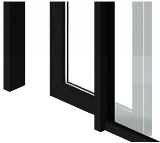
SRT™ BARN 2" NARROW BASE